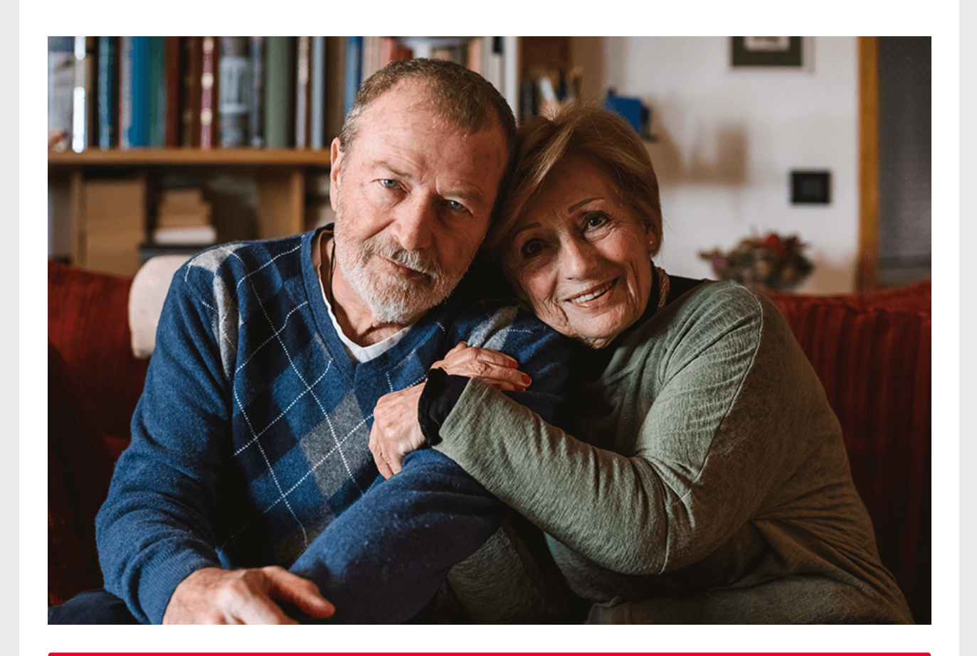
Find Out More

A gift in your Will could get us to the day when every single person with blood cancer survives.